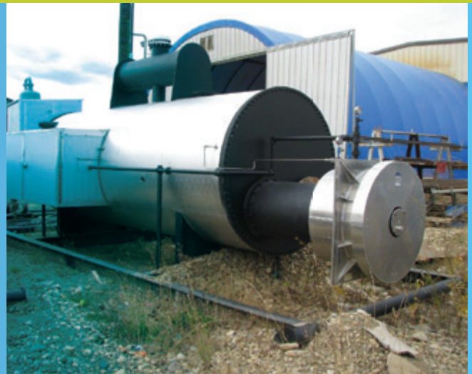
Line Heater Package