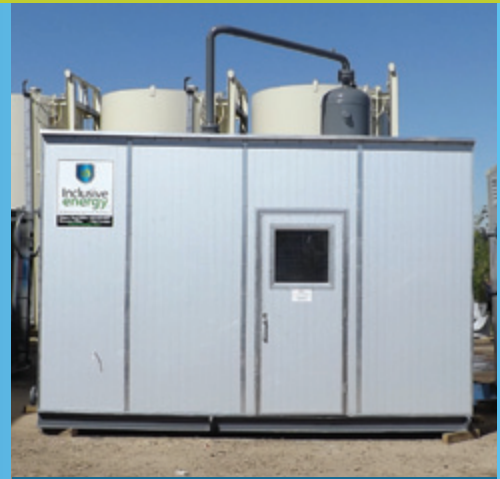
Separator Vessel Full Package